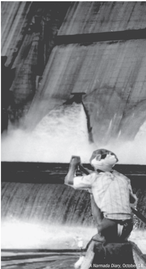
A Narmada Diary , October 14.

Indian filmmaker Anand Patwardhan has described himself as “a non-serious human being forced by circumstance to make serious films.” Active for three decades in the fight for social justice, both in India and abroad, Patwardhan makes documentaries out of passionate political commitment. With a keen eye, a wry voice, and passionate political commitment, he has examined Indian and global realities—economic inequality, environmental devastation, and the challenges facing political movements in this era of fundamentalism and nationalism.